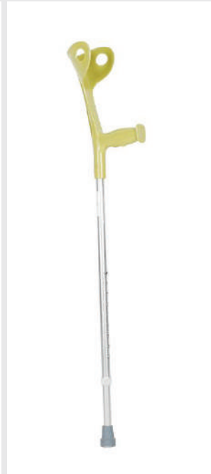
ELBOW CRUTCHES SFN-EC-601