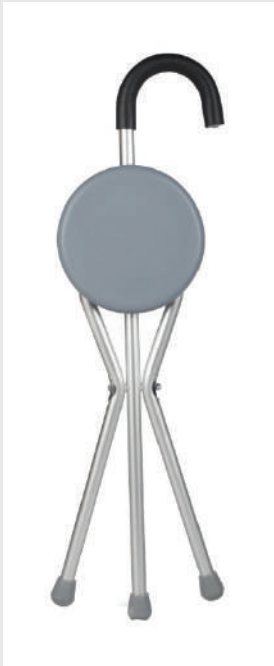
TRIPOD CANE SEAT SK-KL911L