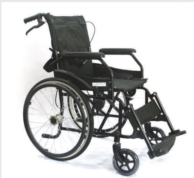
WHEELCHAIR (20") LIGHTWEIGHT- MOROCCAN BLACK SA-LW-104-20-MBLK