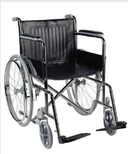
WHEELCHAIR – STD PVC FOOT PLATE SFN-SWC-STD-101