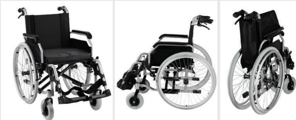
WHEELCHAIR (24") LIGHTWEIGHT - BLACK SK-KL955-L