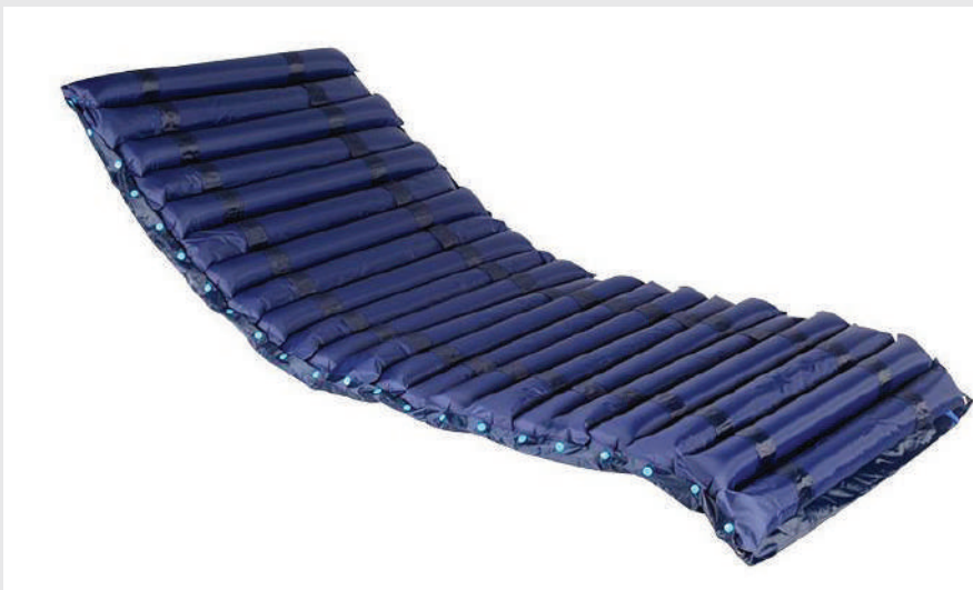
RIPPLE MATTRESS-VERTICAL TYPE SK-KL520-VT