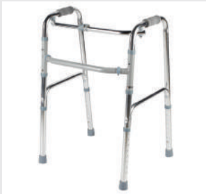
WALKER STRAIGHT SK-KL913