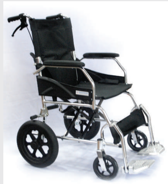
WHEELCHAIR (12") LIGHTWEIGHT-ABSTRACT BLACK SA-LW-103-12-ABLK