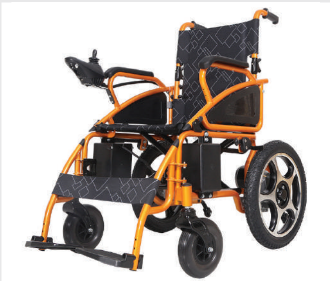
POWER WHEELCHAIR-ORANGE SZ-PWC-803