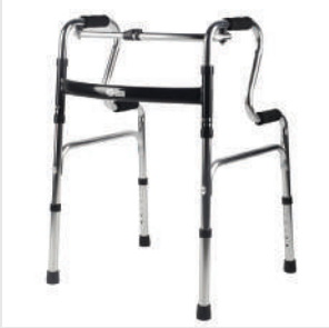
WALKER - CURVE SFN-W-301