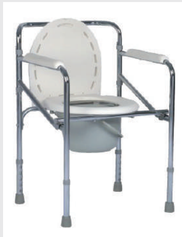
COMMUNE CHAIR WITHOUT WHEELS SK-KL894