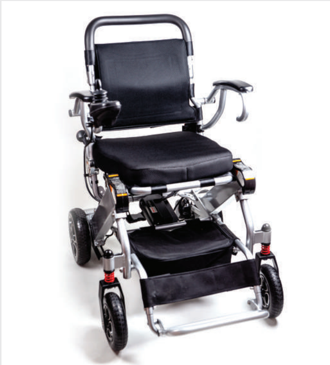
POWER WHEELCHAIR N5513A-BLACK SZ-PWC-N5513A