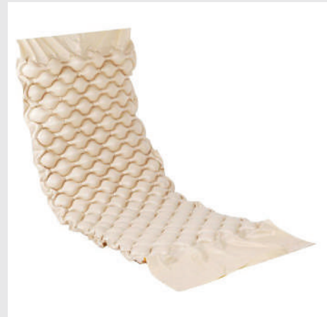
RIPPLE MATTRESS-BALL TYPE SK-KL522-BT