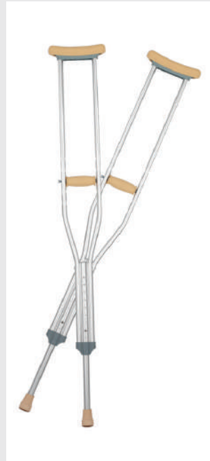
UNDER ARM CRUTCHES SFN-UAC-M-201