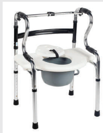
5-IN-1 SHOWER COMMUNE CHAIR SFN-SCC-5IN1-501