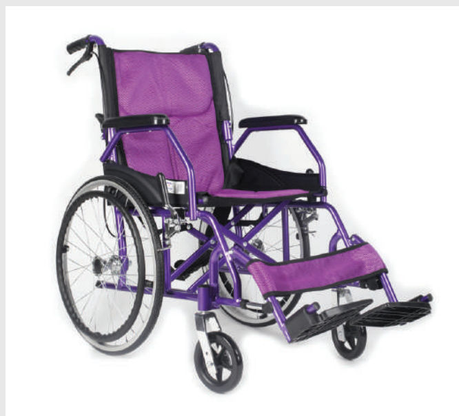
WHEELCHAIR (20") LIGHTWEIGHT- PURPLE SFN-SWC-LW-108-PUR