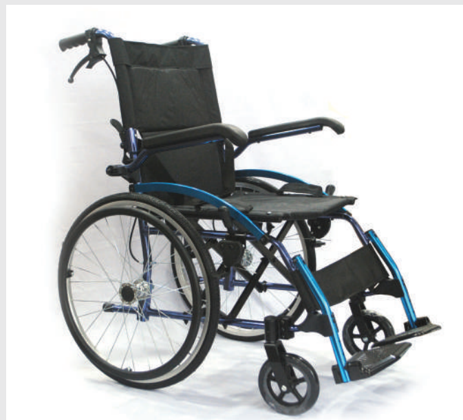
WHEELCHAIR (20") LIGHTWEIGHT- GEOMETRICAL BLACK SA-LW-103-20-BLK