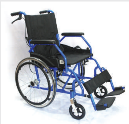
WHEELCHAIR (20") LIGHTWEIGHT - BLUE SFN-SWC-LW-108-BLU