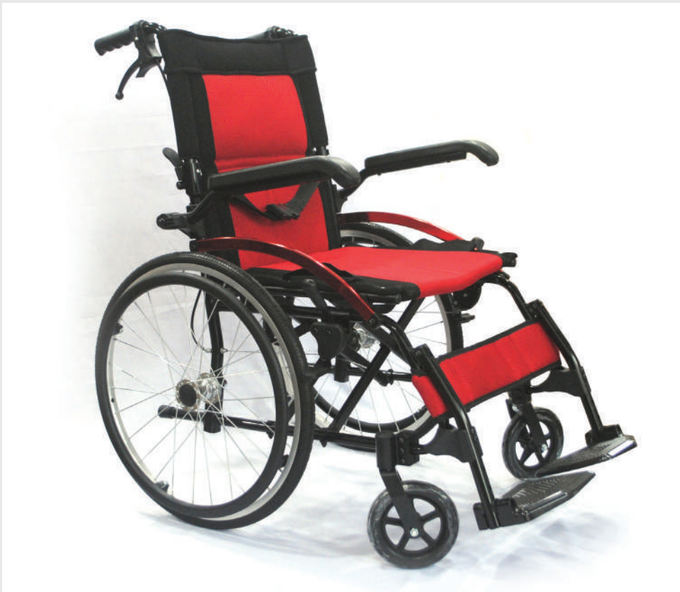
WHEELCHAIR (20") LIGHTWEIGHT- PLAIN RED SA-LW-103-20-RED