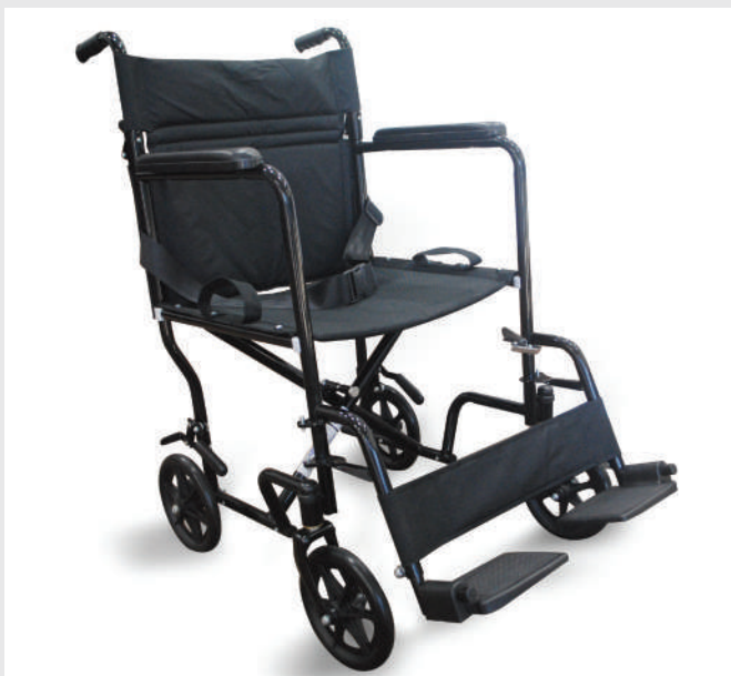
WHEELCHAIR (18") LIGHTWEIGHT BLACK SFN-SWC-LW-301-BLK