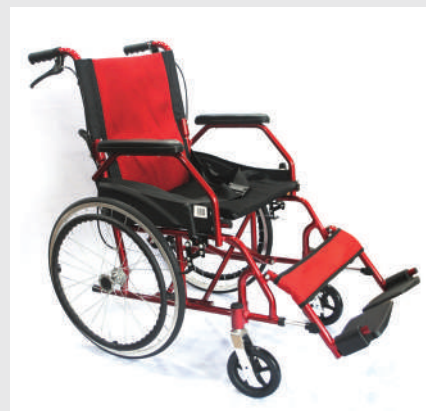
WHEELCHAIR (20") LIGHTWEIGHT-RED SFN-SWC-LW-108-RED