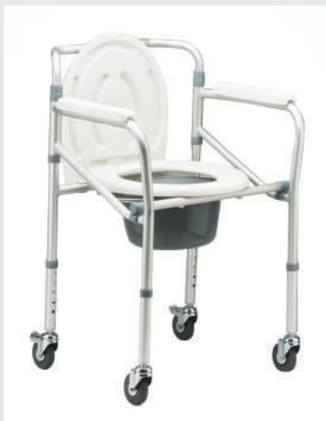
COMMUNE CHAIR WITH WHEELS SK-KL696