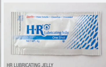
HR LUBRICATING JELLY