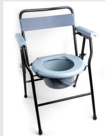
COMMUNE CHAIR SFN-CMO-710-BLK