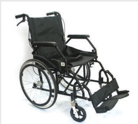
WHEELCHAIR (20") LIGHTWEIGHT- BLACK SFN-SWC-LW-108-BLK