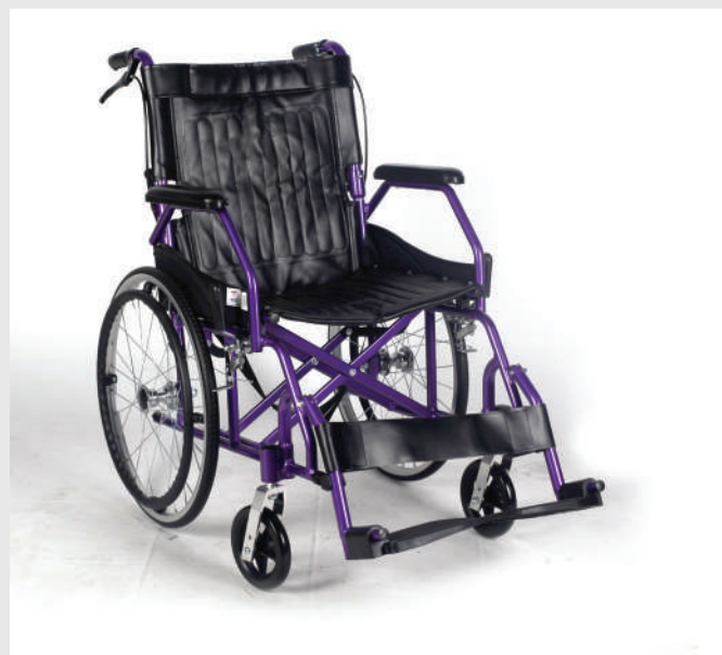
WHEELCHAIR (20") LIGHTWEIGHT- PURPLE PU CUSHION SFN-SWC-LW-108-PUR-PU