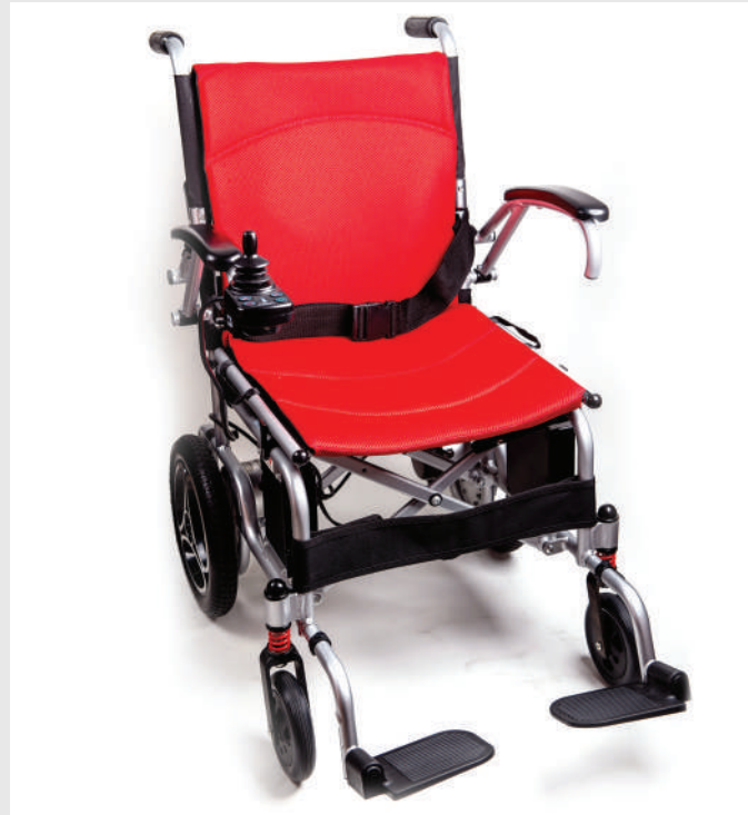
POWER WHEELCHAIR N5519-RED SZ-PWC-N5519