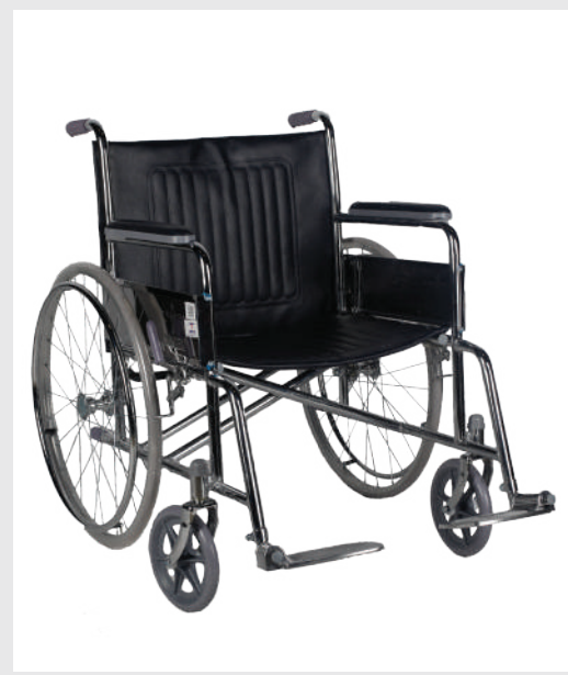
WHEELCHAIR – STD STEEL FOOT PLATE SFN-SWC-STD-102